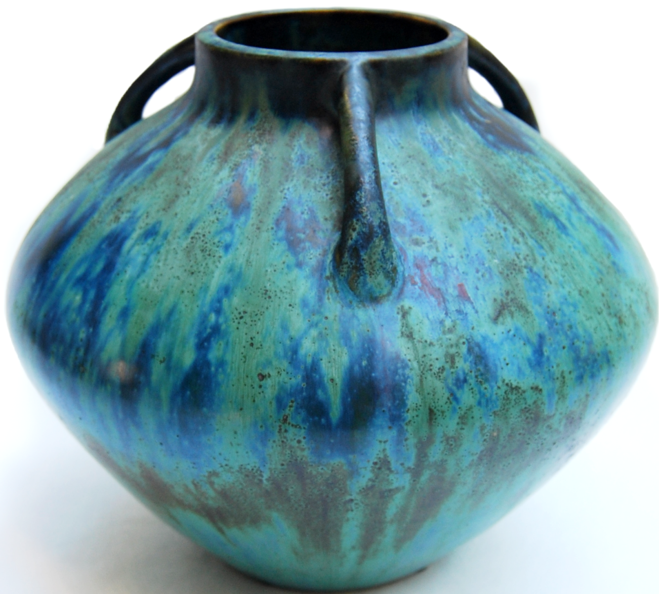
Pierre-Adrien Dalpayrat, Three-handled vase