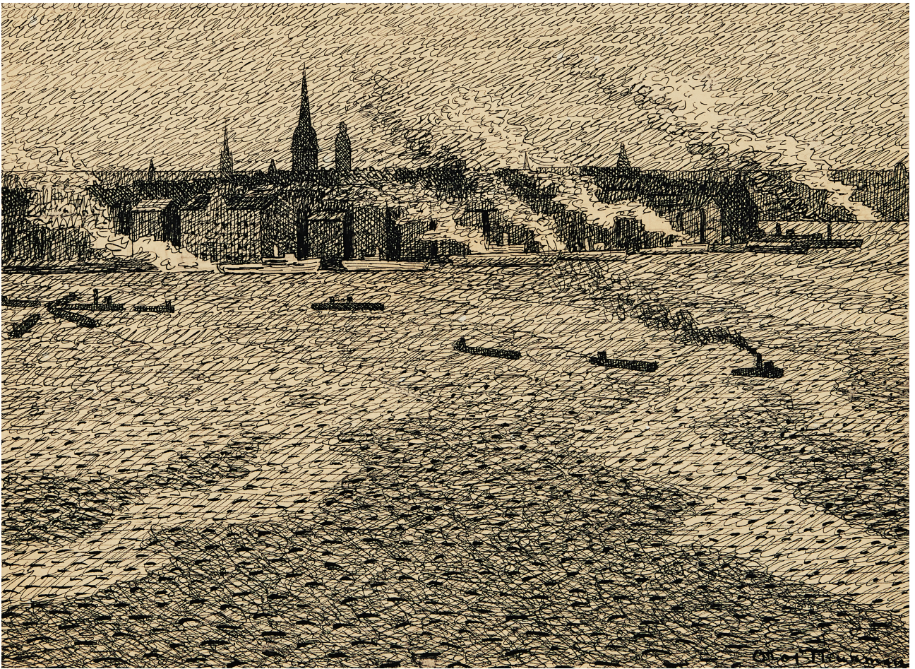
Olof Thunman, At Dusk. View over Gamla Stan, Stockholm