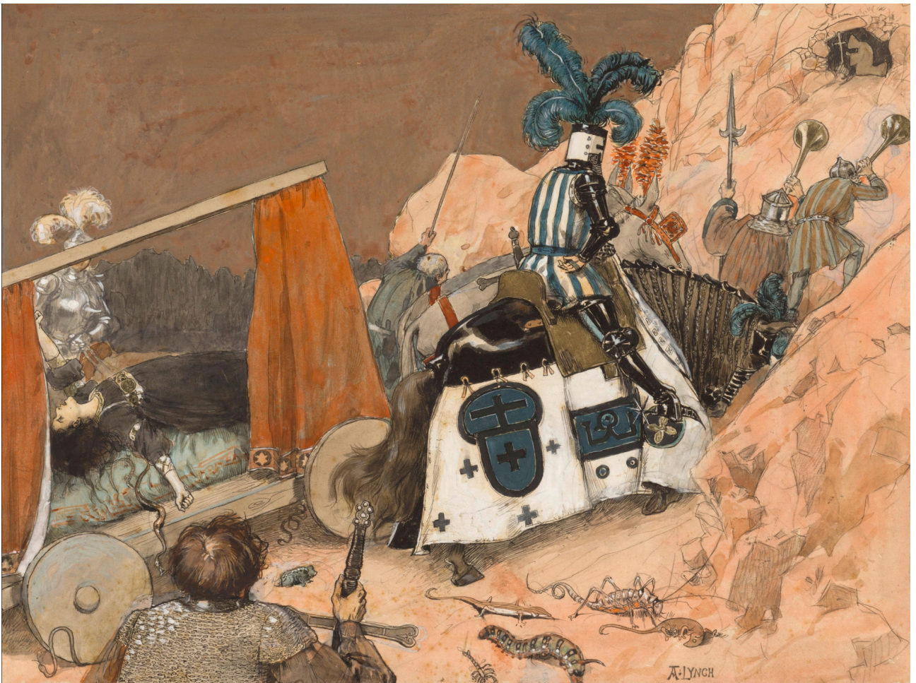
Albert Lynch, The Possessed Woman