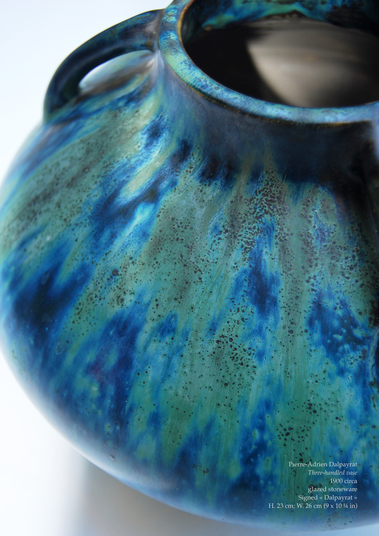
Pierre-Adrien Dalpayrat Three-handled vase 1900 circa glazed stoneware Signed « Dalpayrat » H. 23 cm; W. 26 cm (9 x 10 ¼ in)