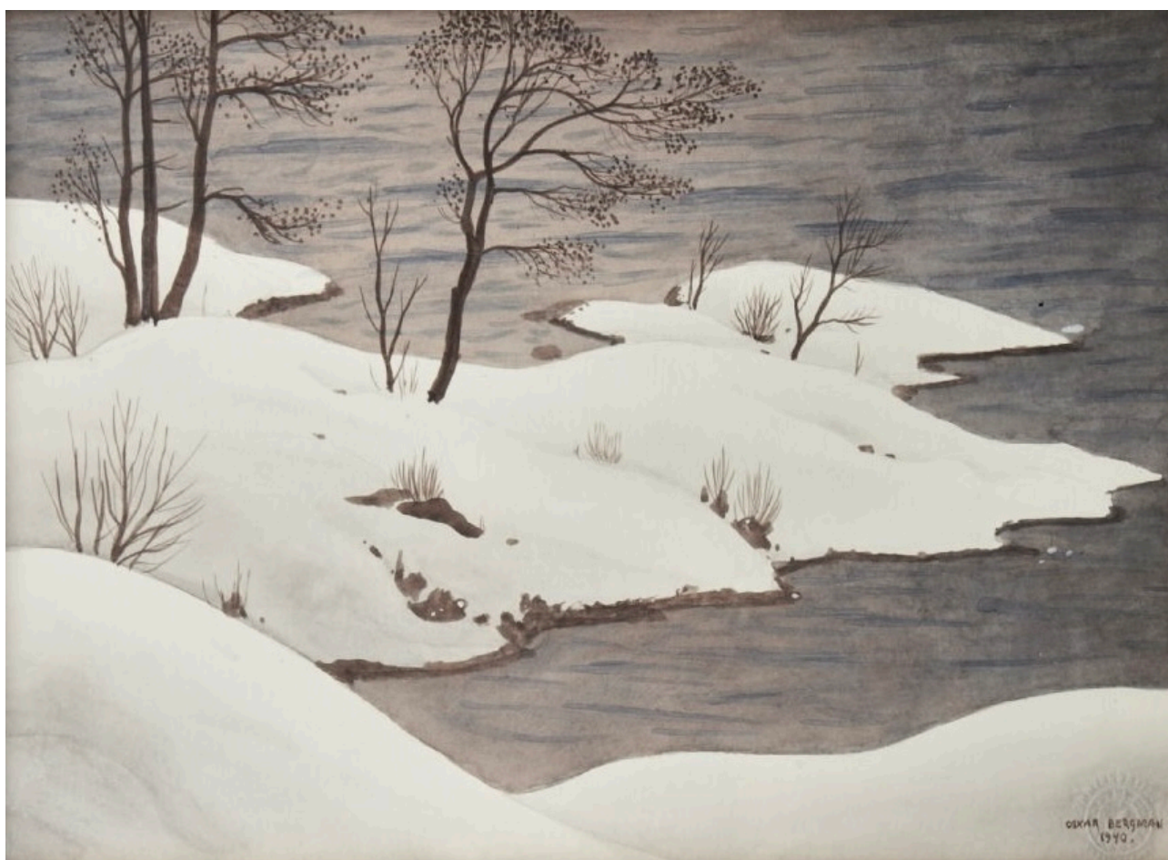
Oskar Bergman, Snowy lakeside